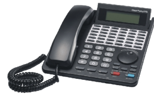
Digital Phone 8150

When it comes to advanced communication requirements it's the technological advantage that enhances efficiency and flexibility of use. The Digital Phones 8150/8180 thus becomes the preferred choice for those who are in need of updating their current communication systems. With its easy-to use Navigation Key (Jog Dial) this phone helps extension users quickly select and control various features, including commonly used settings such as microphone, speaker and ringer volume, and adjusting LED background lightness and colors. Its ergonomic design and operational function contributes to its value addition and makes it convenient to use.